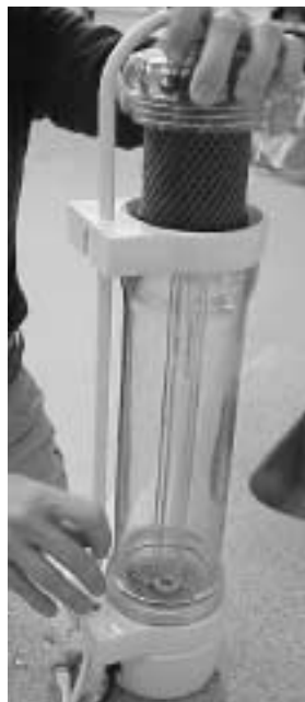
Figure 20 Installing the filter in the unit

Be sure to guide the outlet tube into the bottom fitting.